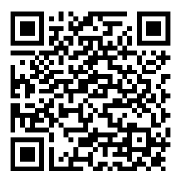
Concern for Climate Change